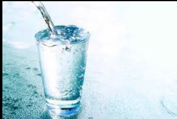
Clean drinking water